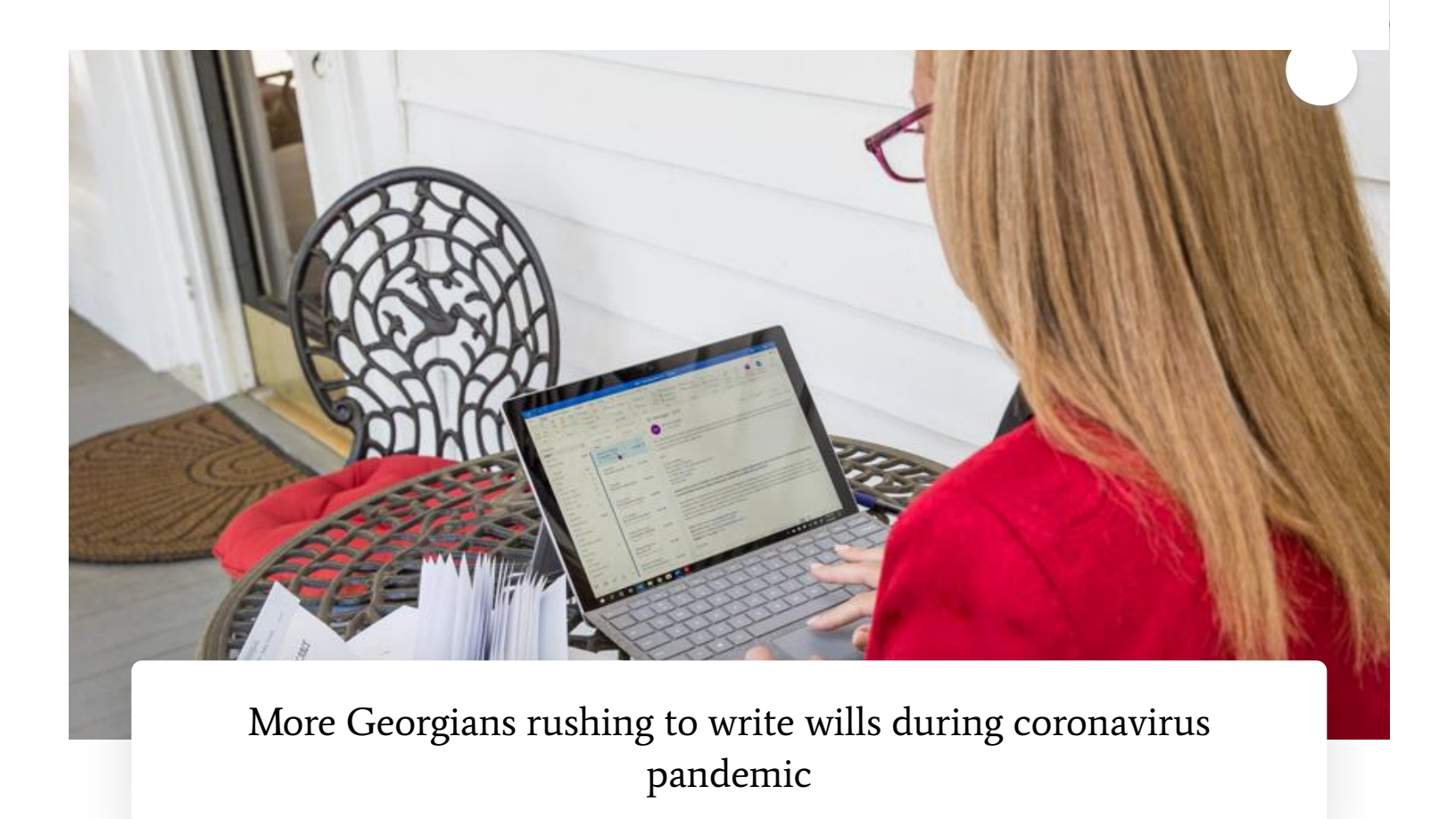
LIFE | 2 hours ago